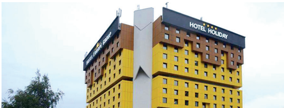
Hotel Holiday, Congress Center, st. Zmaja od Bosne 4, Sarajevo

The First Congress of Endoscopic Surgeons of Bosnia and Herzegovina (AESBH) will be held in Sarajevo, Bosnia and Herzegovina, from Friday 9th to Sunday 11th September 2022. All scientific sessions and the commercial exhibition will be held at the Congress Center of the Holiday Hotel.