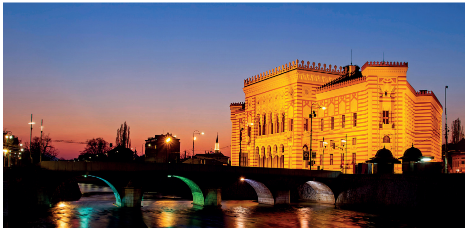
Vijećnica (st. Obala Kulina Bana)

After the opening ceremony, you are invited to the dinner at the Vijećnica (City Hall).